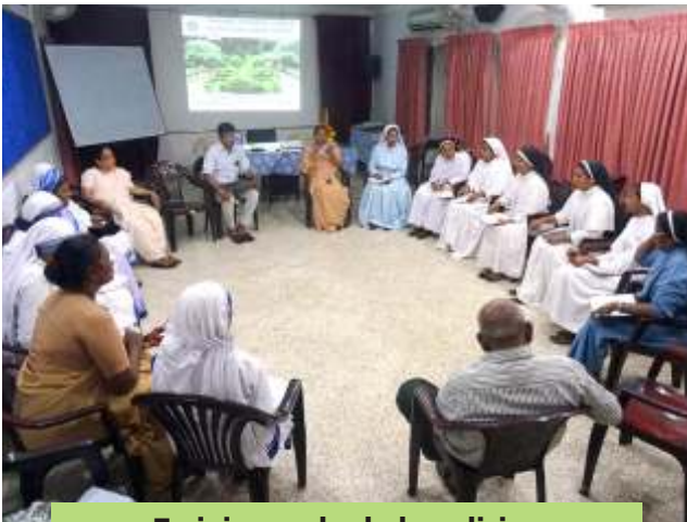
Training on herbal medicine and Herbal garden