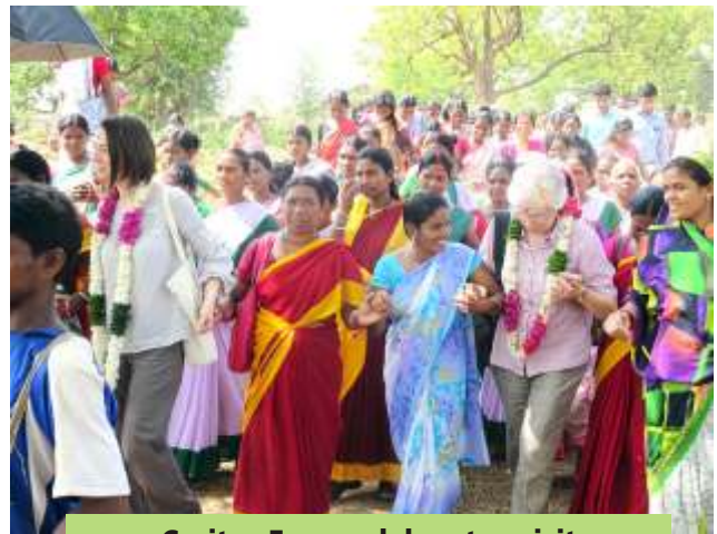
Caritas France delegates visit