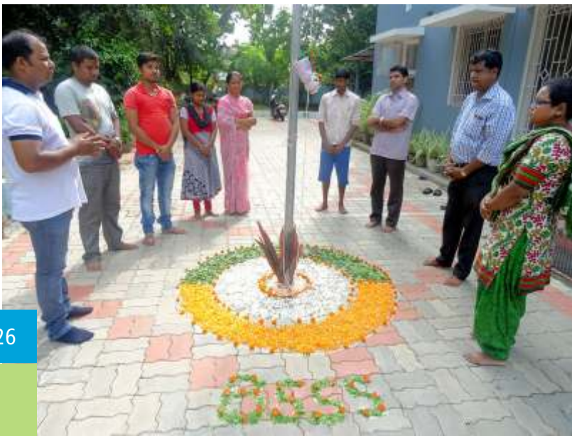
OBSERVATION OF INDEPENDENCE DAY WITH BSSS STAFFS