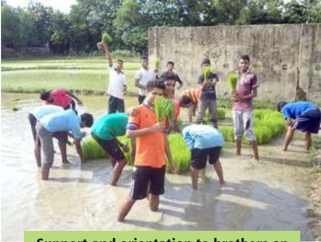
Support and orientation to brothers on Paddy cultivation