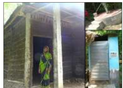
EMERGENCY AND DISASTER PREPAREDNESS