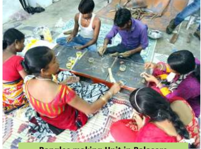
Bangles making Unit in Balasore