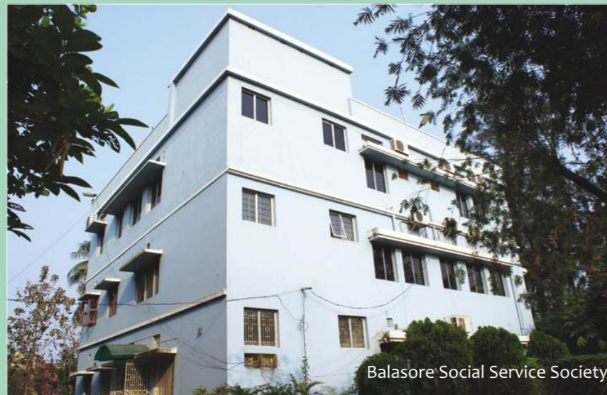
Balasure Social Service Society

For more details kindly talk to us at the above contacts. All your donations would be exempt from Income Tax u/s 80 G